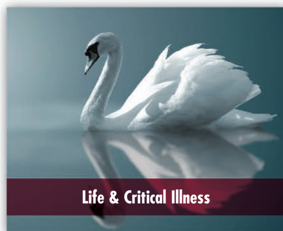
Life & Critical Illness